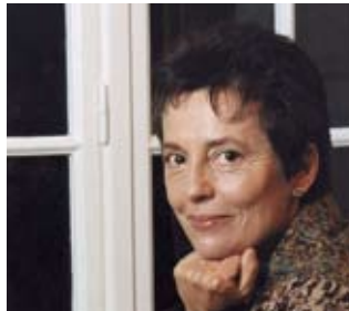
Maria João Pires