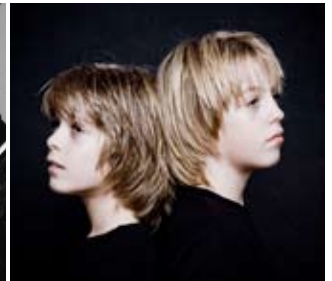
Arthur and Lucas Jussen